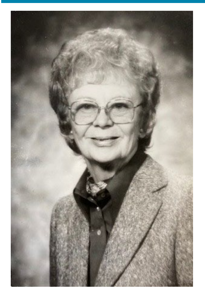
MAYOR KATHLEEN (KAY) GROUHEL (1965 – 1976)