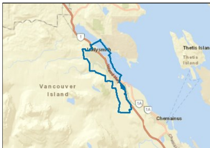
Number of Private Apartment Units